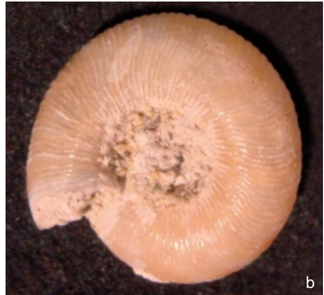
Fig. 1. Discus rotundatus , "Grotta delle Felci", Capri (Naples), diameter 4.9 mm: a. apical view; b. umbilical view.