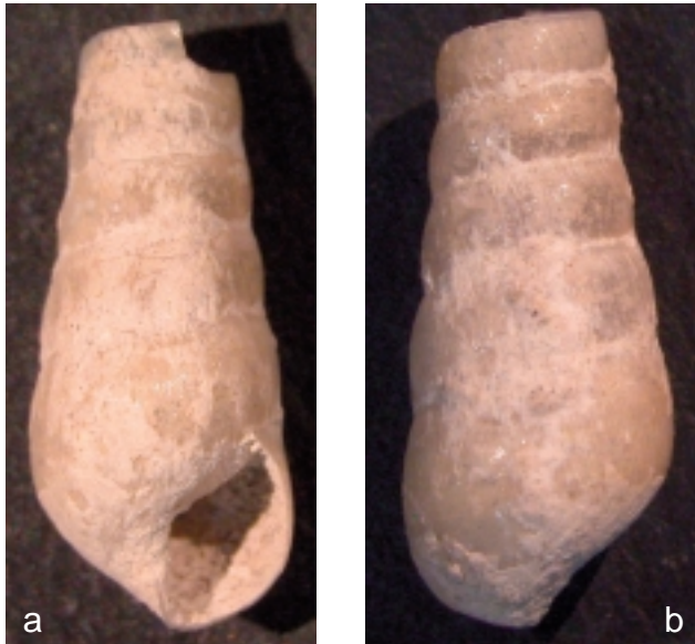
Fig. 3. Rumina decollata "Grotta delle Felci", Capri (Naples), length 21.7 mm: a. apertural view; b. adapertural view.