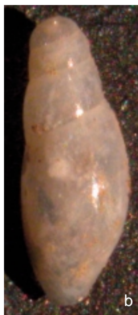
Fig. 2. Cecilioides acicula "Vascio 'o Funno" Cave, Capri (Naples), length 3.2 mm: a. apertural view; b. adapertural view.